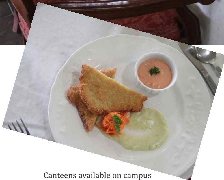
Canteens available on campus