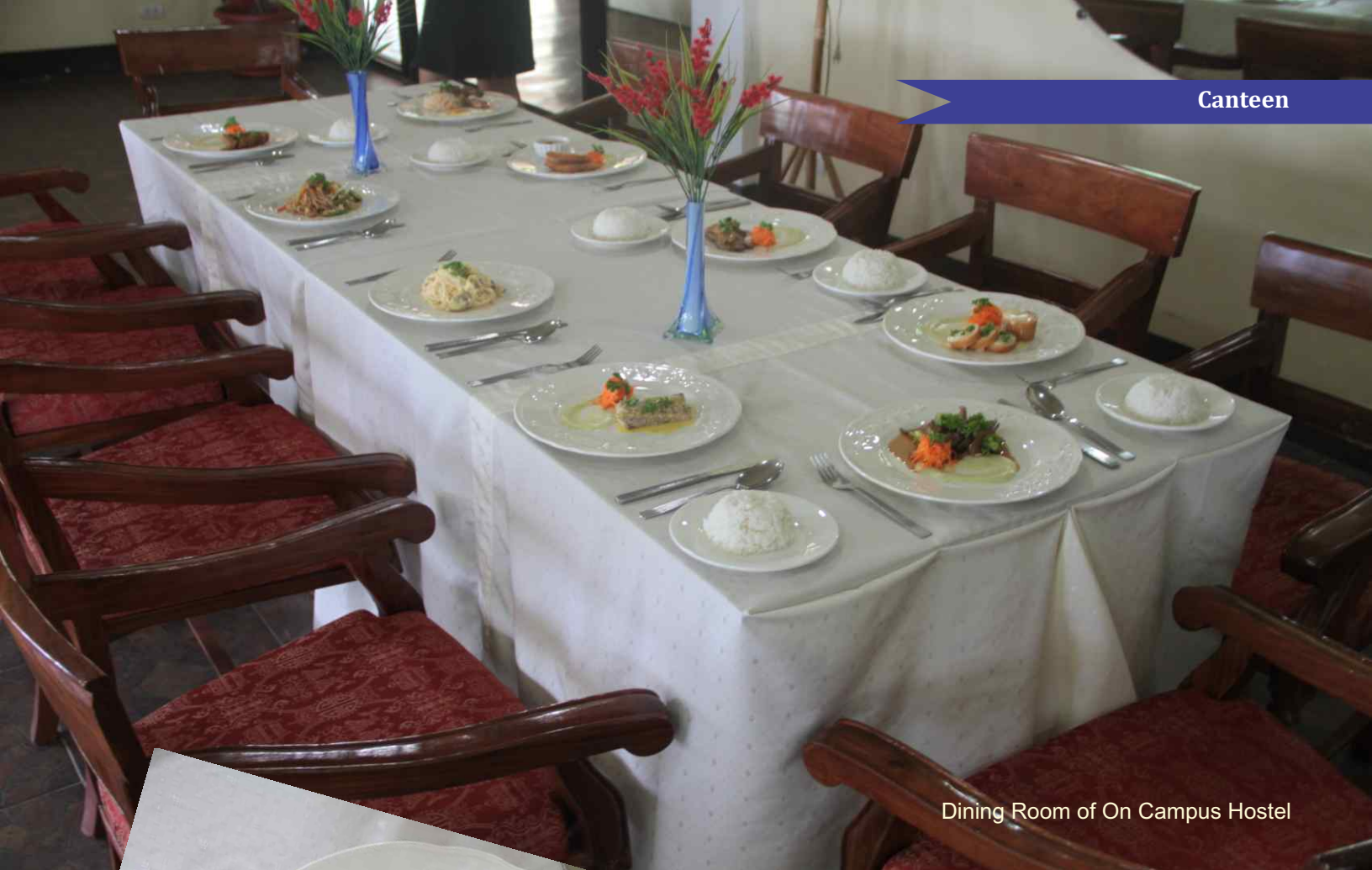
Dining Room of On Campus Hostel