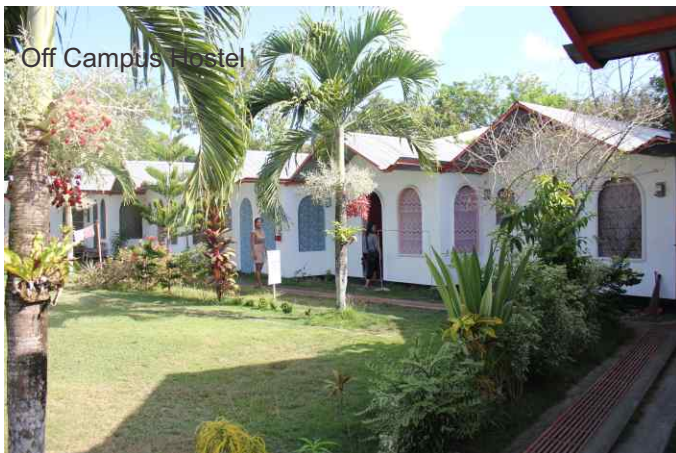
Off Campus Hostel